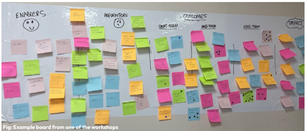
Fig: Example board from one of the workshops

A paper on the VN Vision work was published in The Veterinary Nurse in December 2025: Dugmore, J., and Macdonald, J. (2025) 'The future of veterinary nursing: challenges, opportunities and a vision for progress.' The Veterinary Nurse . Vol.16 (10), pp 228–234.