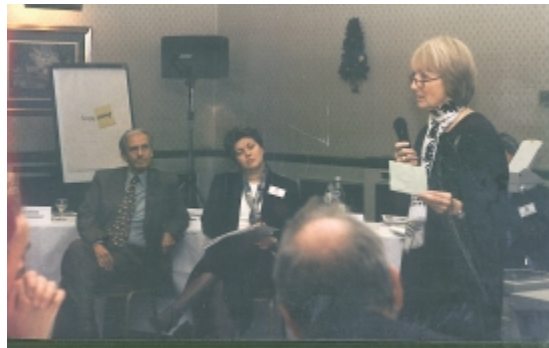
Scenes from the Regional Meetings in Cardiff and Stratford-upon-Avon, November 1999