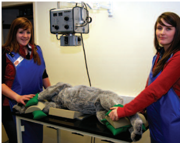
A canine mannequin was purchased by Harper Adams in 2010, thanks to the Spencer Hill Equipment Award

For more information about all of these initiatives, visit www.rcvstrust.org.uk .