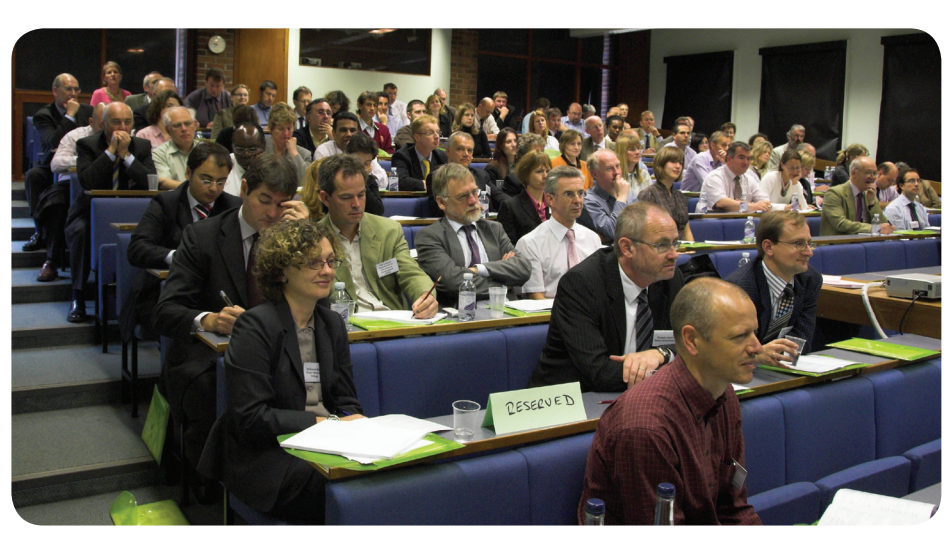
GVS Members and other European colleagues participate in the GVS 2007 Conference hosted by Glasgow Veterinary School in 2007.

DEF-PB13080-EMS.indd 5 10/6/2008 13:49:56