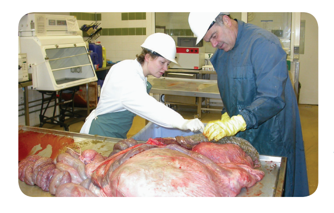
The VLA Regional Laboratories offer EMS placements to veterinary undergraduate students.