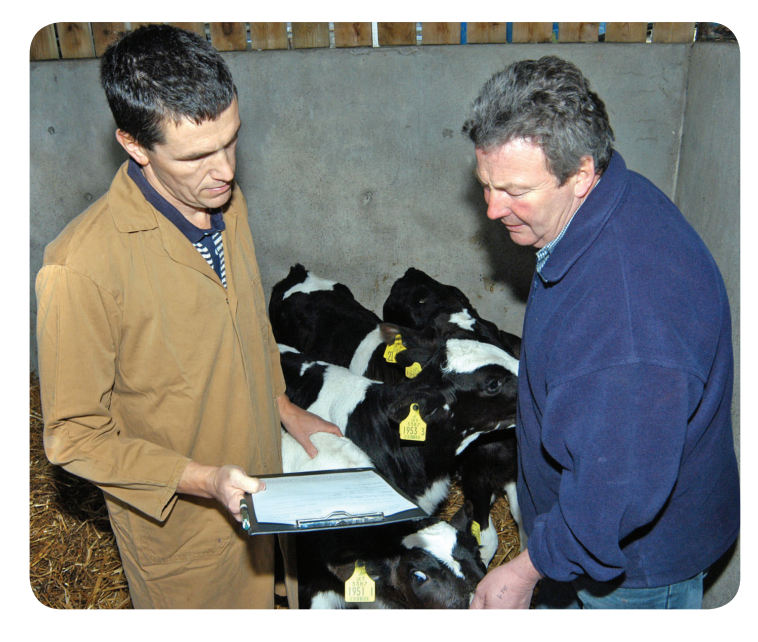
Veterinary students may be involved in a range of activities.

Initial contact should be made through the Northern Ireland CVO's secretary at telephone 028 9052 5565. www.dardni.gov.uk